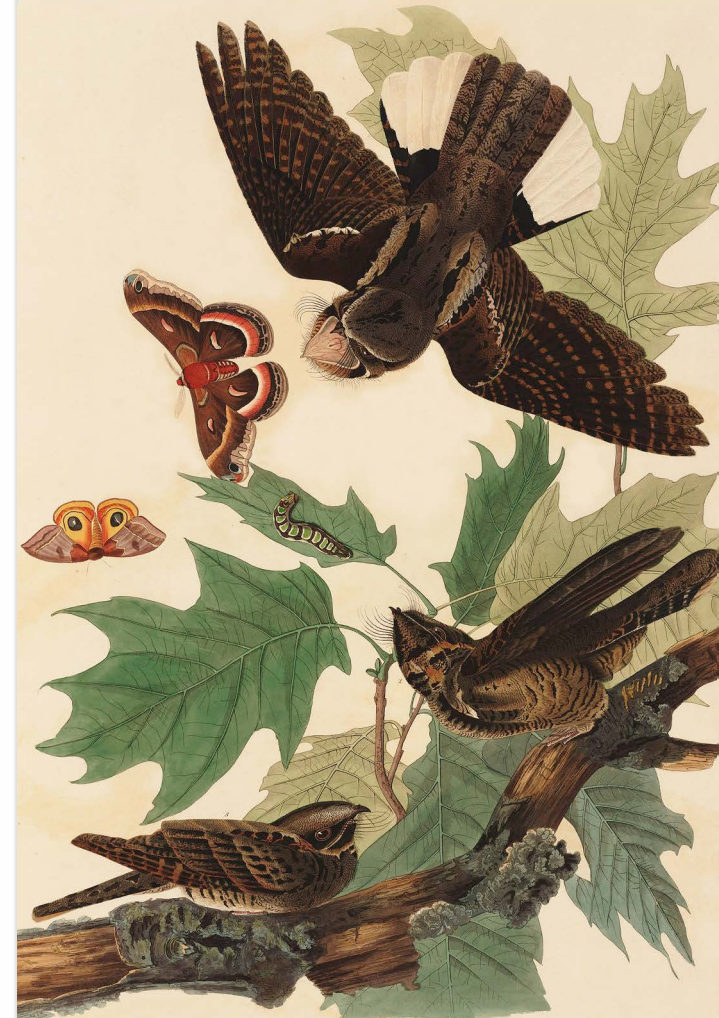
PAINTING: JJ AUDUBON