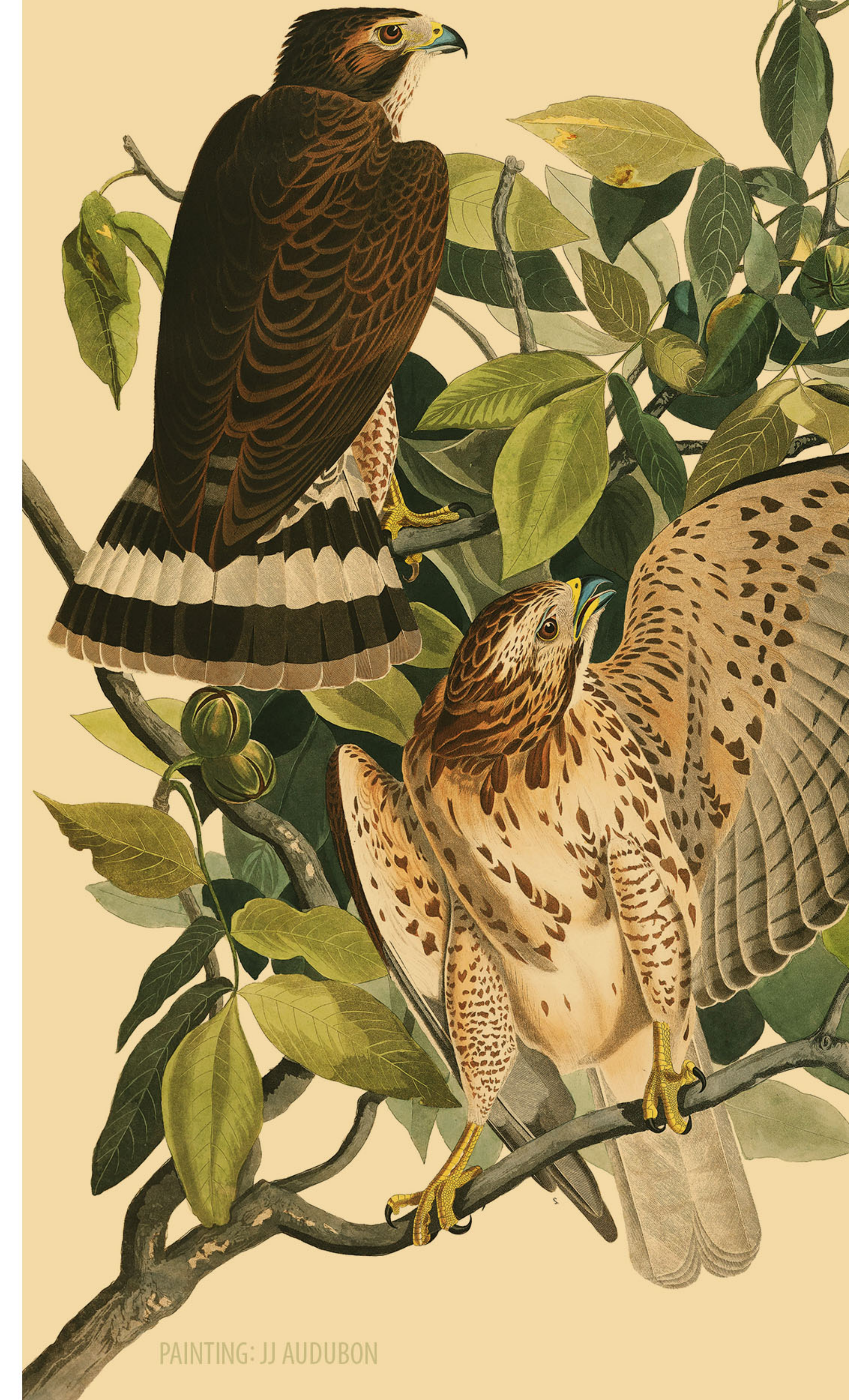
PAINTING: JJ AUDUBON